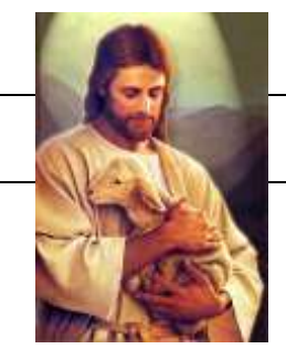
May 8, 2022 Fourth Sunday of Easter