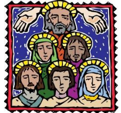
ALL SAINTS' DAY

9:00 a.m. Mass 10:00 and 11:00 Grade 1 Classroom Visits 1:15 p.m. First Communion Class